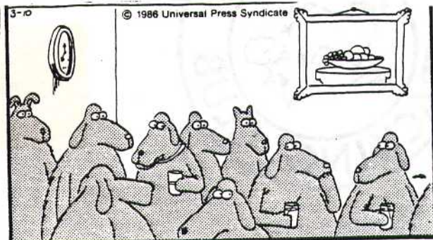
Canine social blunders