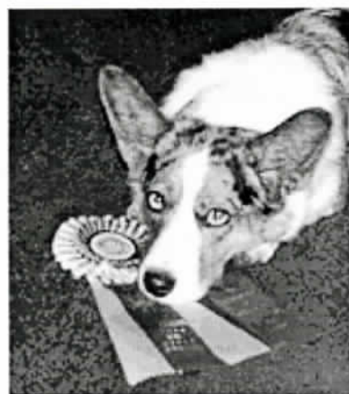
Ch Cortwyn's Mace Windu, HT, TD