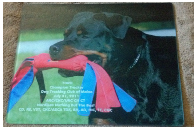
Toro's CT Plaque