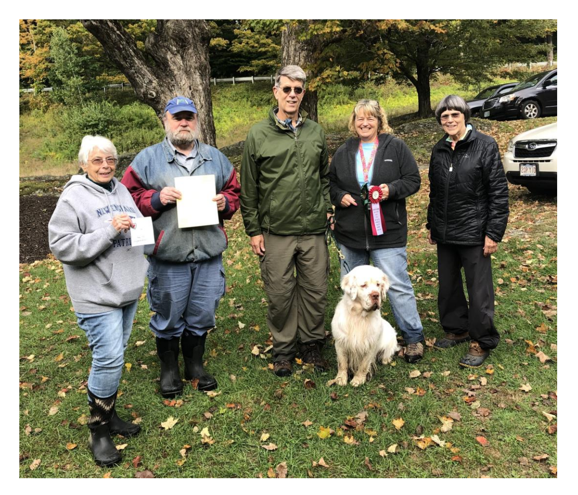
Pioneer Valley KC TD test Sept. 25, 2022